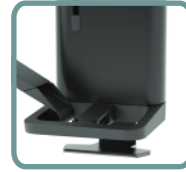
SLIM PROFILE 98-490-224 (MATTE BLACK)