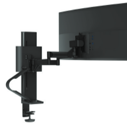
Single with Panel Clamp