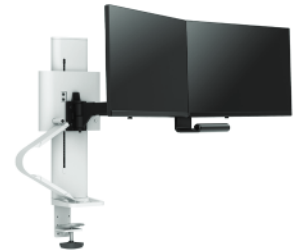
Dual with Panel Clamp